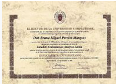
Diploma of a Own title of the Complutense University of Madrid ( University Specialist ).

=== PhD as own degree === A PhD of its own title must overcome a more flexible and diversified internal normative process (in the university itself). Its officiality comes from the guarantee of being a title that has surpassed in turn all the normative and quality controls of a public University.